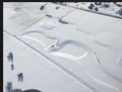
Storm Water Facilities